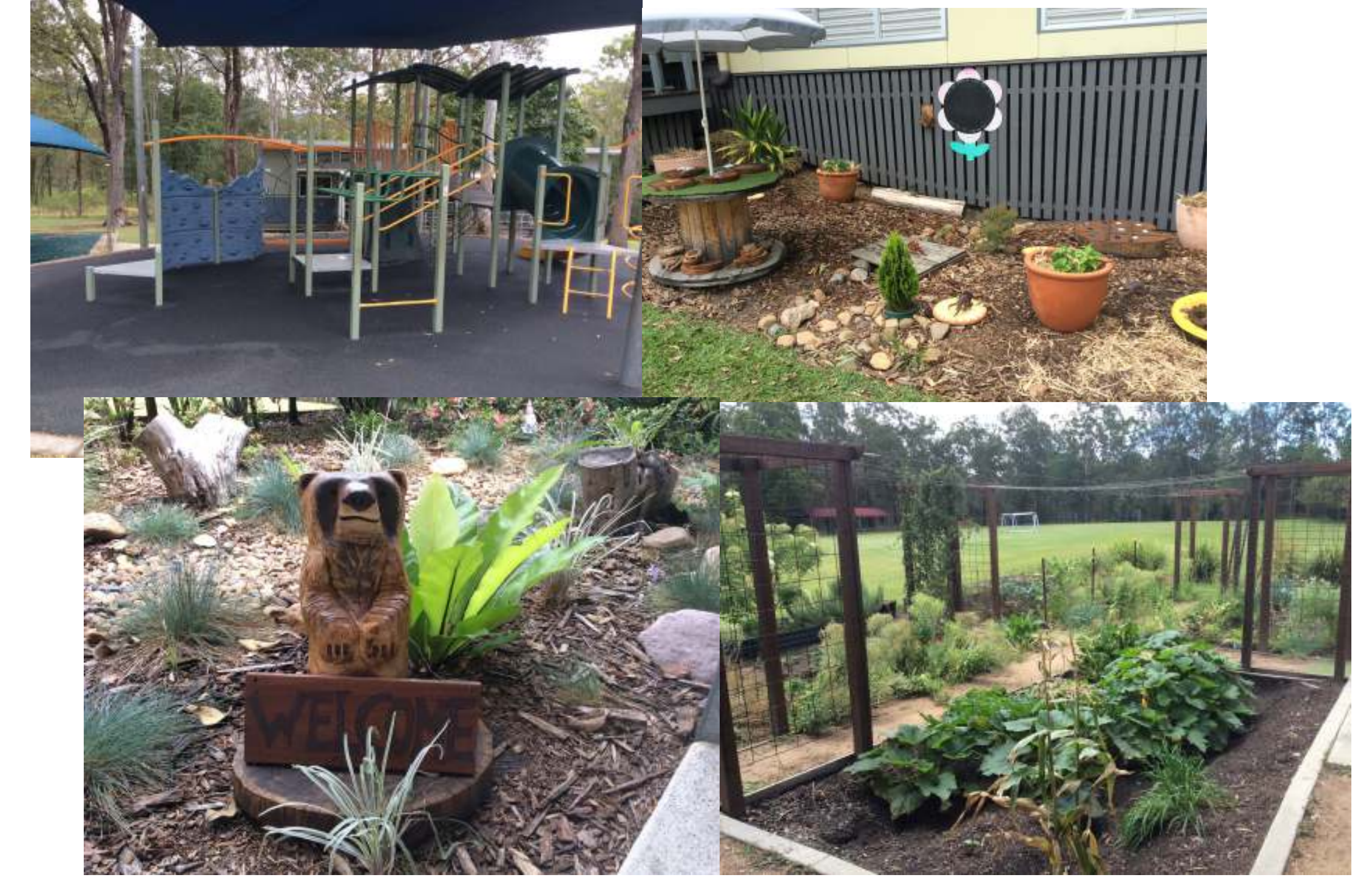
And, every day, I will get to see and do a lot of cool things!